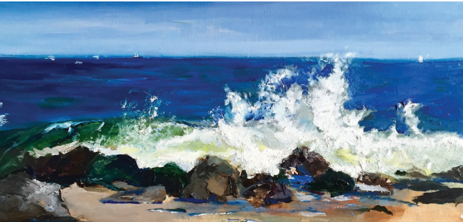
"Surf's Up," 8" x 16", oil on canvas, 2016, Monmouth Beach