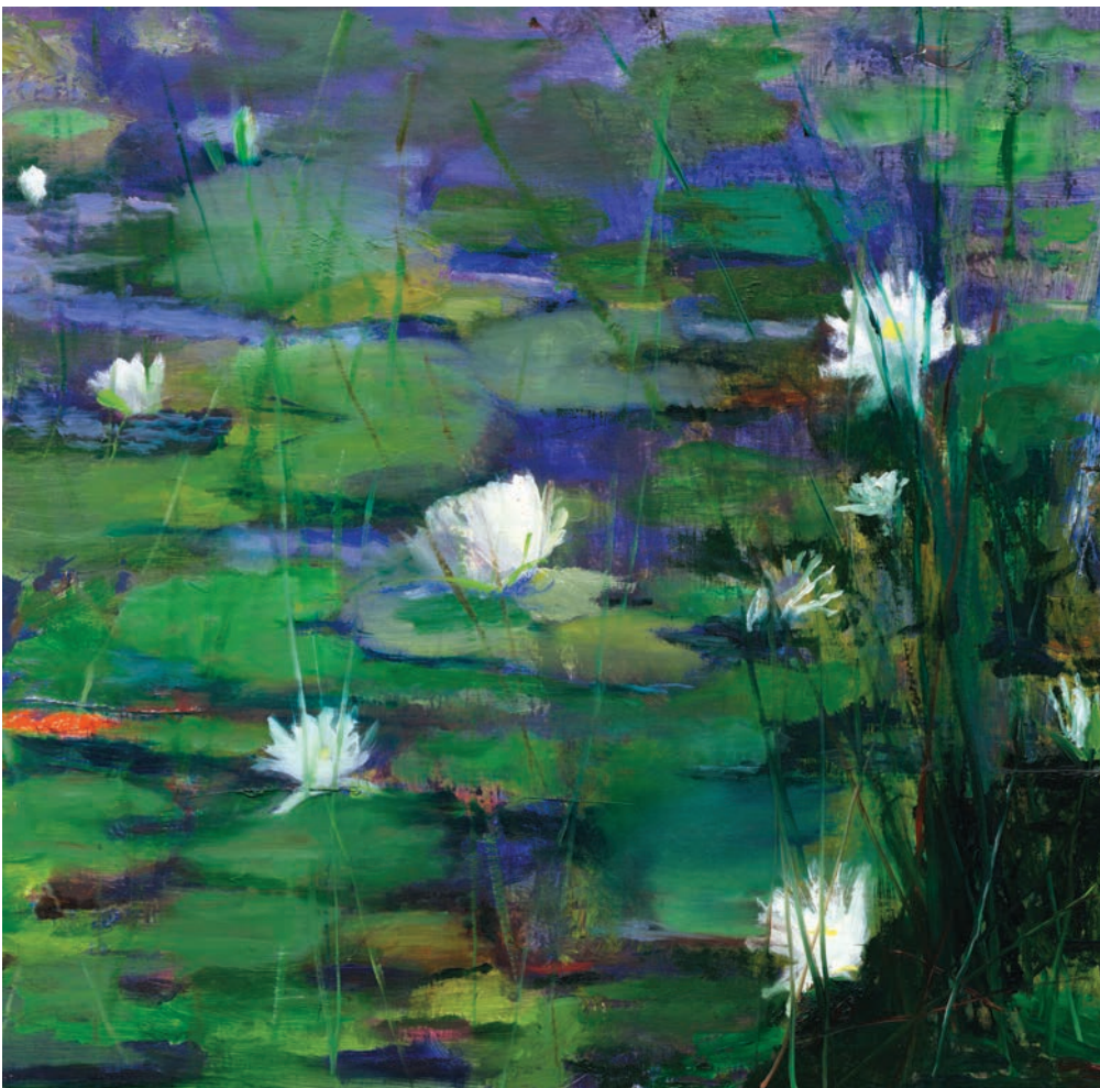
"Water Lillies, Spring Lake" 20" x 20", oil on canvas, 2018