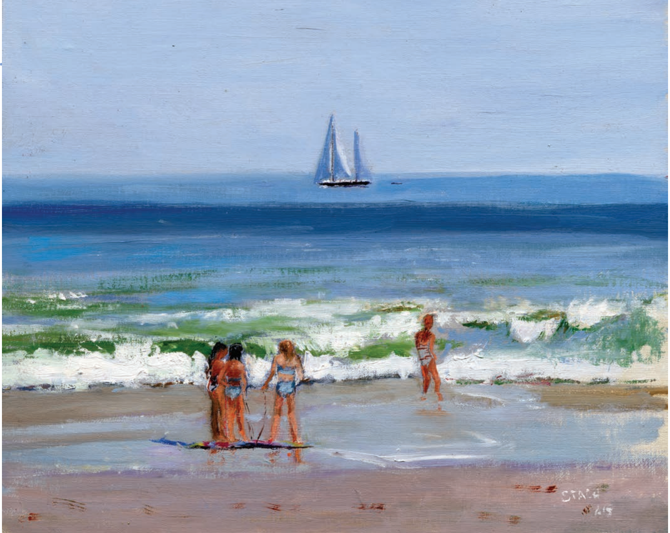
"Low Tide III," 9" x 12", oil on canvas, 2015, Monmouth Beach

Luckily, the Jersey Shore, with its plethora of rivers, inlets, ponds, and coastline, provides plenty of inspiration. "I feel blessed to live in paradise," she says.