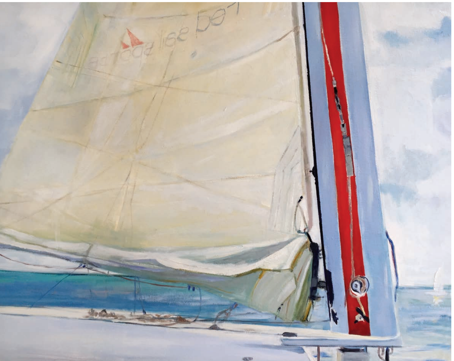
"Heading Out," 16" x 20", oil on canvas, 2014, Sea Bright

Frederick Galleries 1405-1 Third Avenue, Spring Lake (732) 974-0376 www.thefrederickgalleries.com