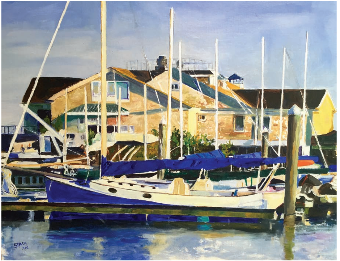
"Rumson Country Club Riverhouse" 16 x 20, oil on canvas, 2013 Shrewsbury River, Rumson