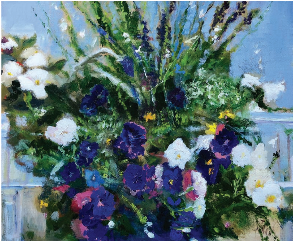
"Window Box" 11" x 14", oil on canvas 2019, Monmouth Beach