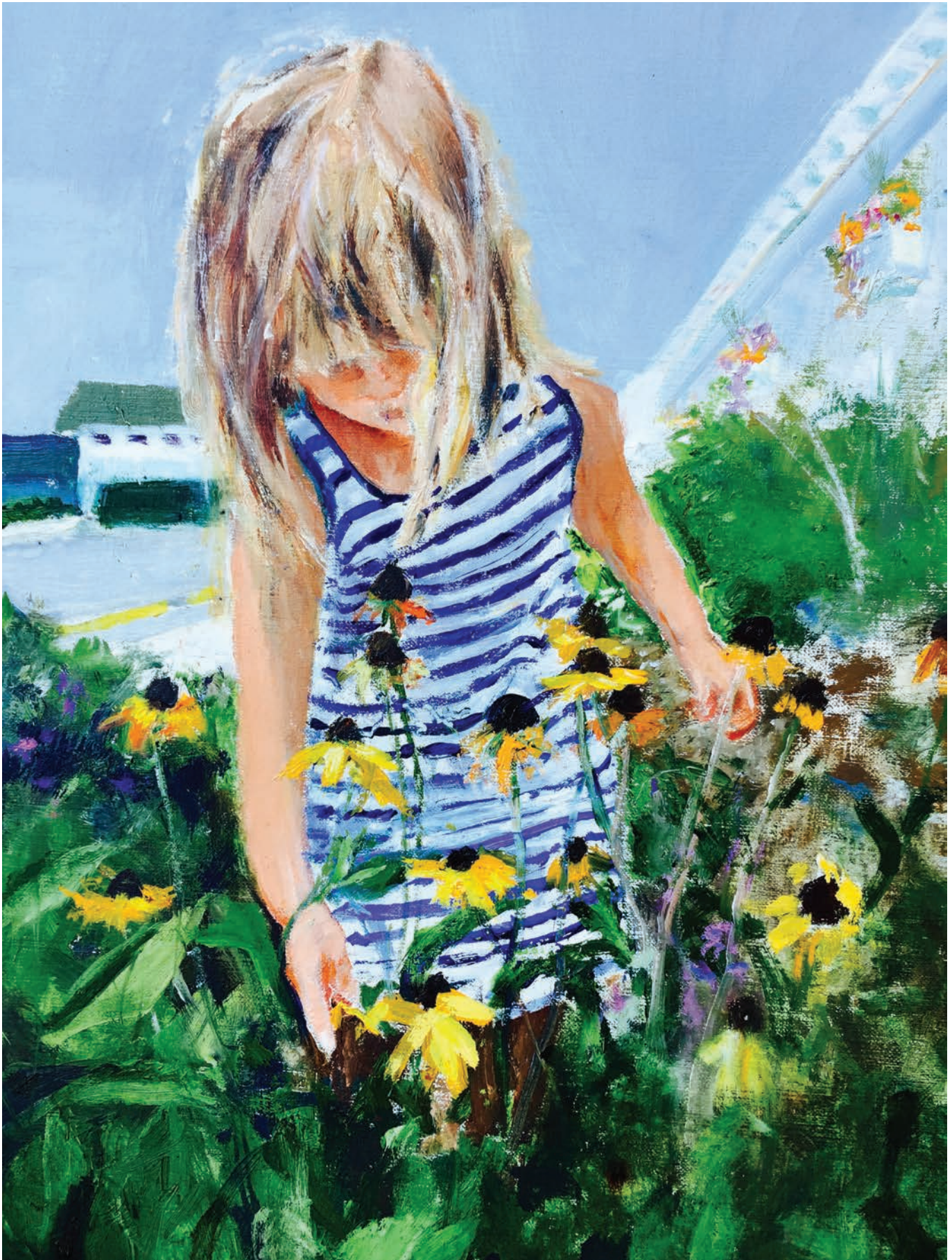
"Favorite Times," 10" x 12", oil on canvas, 2015, Monmouth Beach