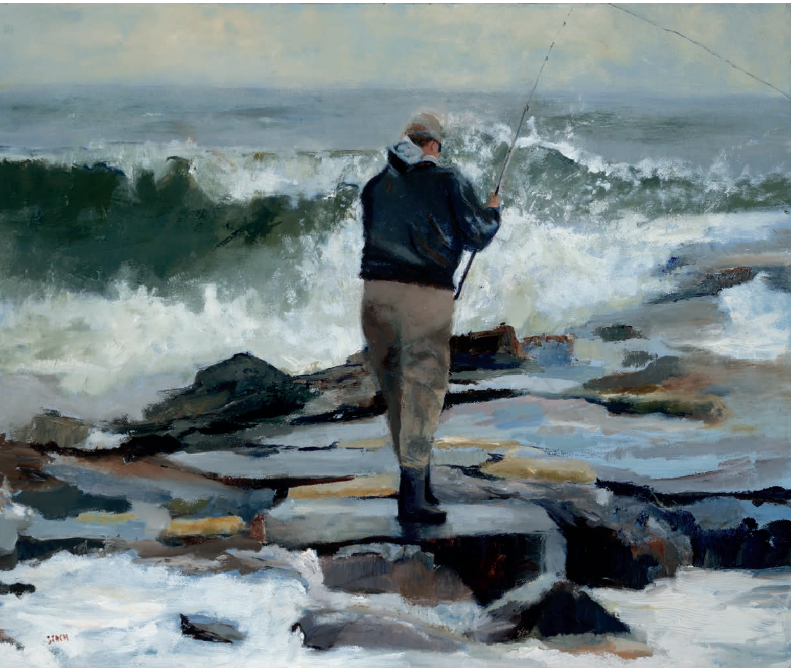
Above: "On The Rocks," 20" x 24", oil on canvas, 2011, Allenhurst