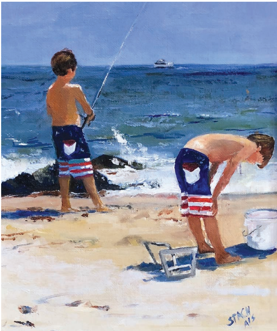
"Brothers Fishing" 11" x 14", oil on canvas 2019, Monmouth Beach