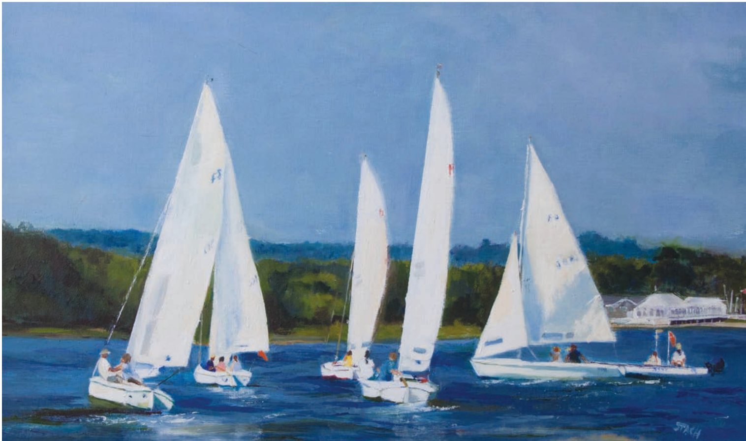
"Best Of Times," 12" x 20", oil on canvas, 2013, Fair Haven